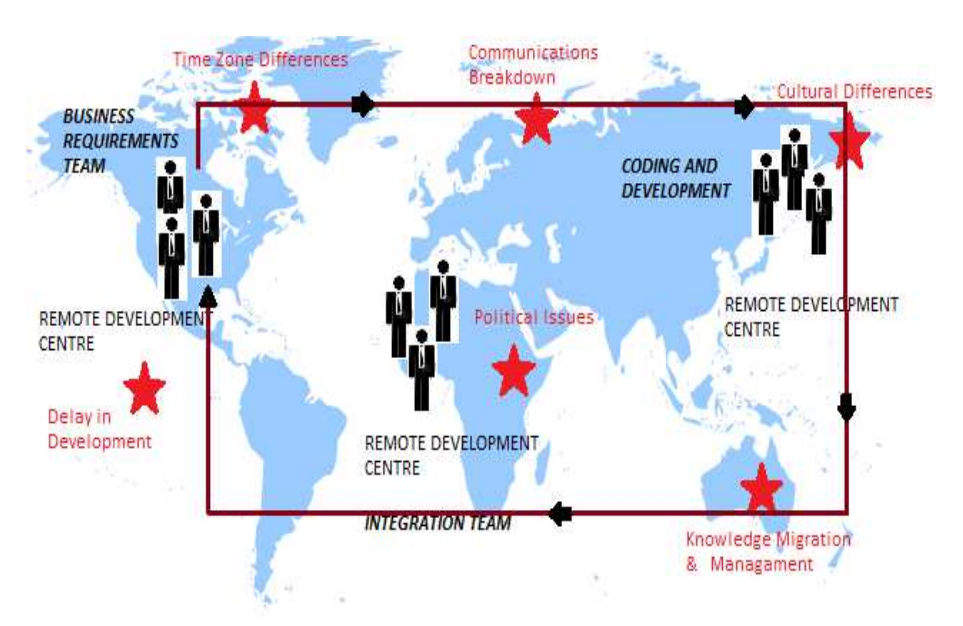
Fig 1: Problems in Multi-site Organization

Furthermore, while doing offshore development, inadequate communication/coordination can also pose additional challenge. Remoteness may cause hindrance for the comfortable and interactive (face to face) communication as the stakeholder's interaction with the team depends upon the communication medium which can be synchronized or asynchronous. In GSE, different stakeholders like customers, developers and